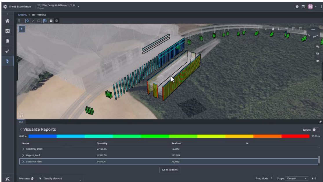
Example of Bentley's Carbon Analysis capabilities: Embodied carbon visualization in an airport design