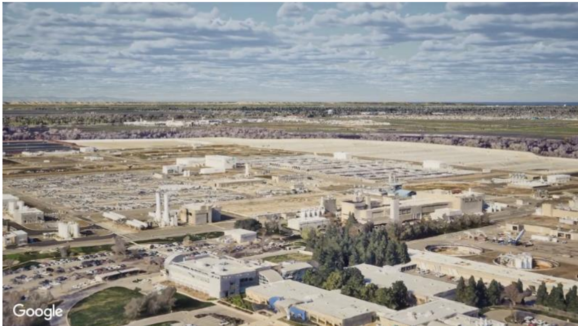
Example of an open data ecosystem enabled by iTwin to allow users access to photorealistic Google 3D tiles, based on Cesium technology.